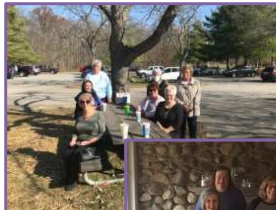
Staying connected through our study groups