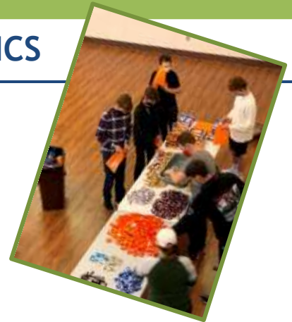
STUFFING TRUNK-OR-TREAT BAGS